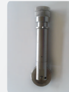
Creasing Wheel (Paper)