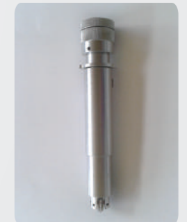
Creasing Wheel (Thicker Boards)