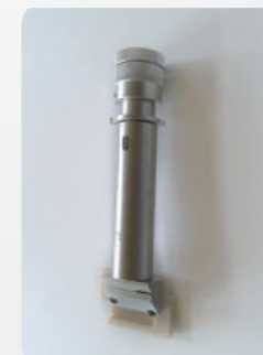
V Cut Knife